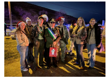
Hanging with the Scouts