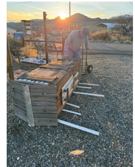
Old Customs Office retired but not gone!