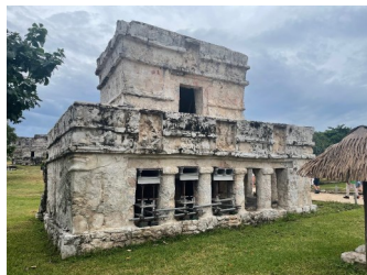
Temple Of The Frescoes, Tulum