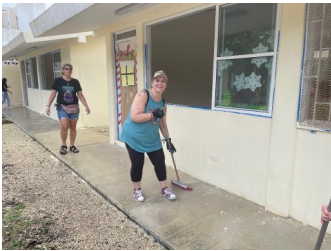
The First Lady Cleans Up