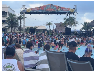
Concert By The Ocean