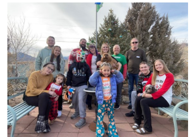
The Molossian Family Gathered for the Holiday. !