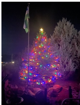
The National Christmas Tree In Republic Square.

Christmas is a major holiday in Molossia and a time of great tradition as well as festivity. Traditionally a three-day celebration, the holiday actually began on December 24th with a small Molossian family gathering. Christmas Eve dinner consisted this year of a light fare of various snacks and desserts, especially Christmas cookies. The evening ended with the reading of the "Night Before Christmas", a Molossian tradition. Christmas morning, December 25th, began early, as the family descended upon the pile of presents beneath the National Christmas Tree. Later, Molossians gathered from miles around in Government House to exchange gifts and engage in family revelry, including playing Christmas games. Once the present-opening ended the rest of the day was spent relaxing, enjoying gifts and watching movies. Boxing Day is on December 26th, and is the last day of the Christmas holidays. While no special events usually take place, dinner on Boxing Day is usually shepherd's pie, Molossian style. This wrapped up the Christmas events for the year, with everyone eagerly looking forward to the distant arrival of next year's Christmas!