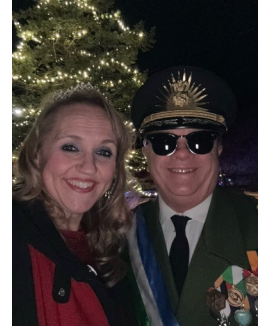
Festive First Couple

The Christmas Season is upon us, and in what has become an annual tradition, His Excellency, The President and The First Lady visited the annual Dayton Small Town Christmas, a tree-lighting and holiday event held in nearby downtown Dayton, in the town park. The President donated canned goods to the needy, passed out candy canes to children and visited Santa with the First Lady, while mingling with the festive holiday crowd. As always, Molossians are very popular in the community outside our door, and it's a pleasure to celebrate and share the Christmas holiday with them. Of course the event is an excellent opportunity to spread awareness of our nation as well as being great fun!