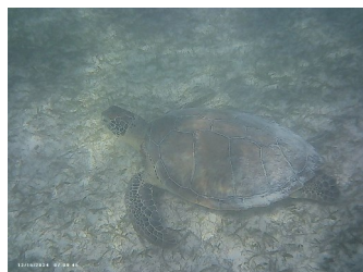
Grazing On Sea Grass