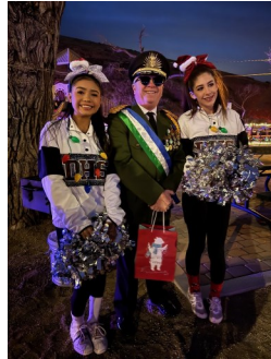
The President and Dayton High Cheerleaders