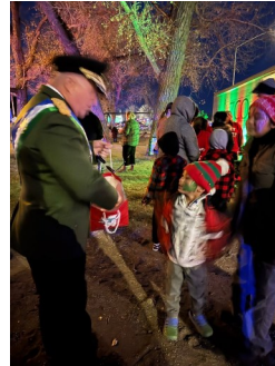
Action Shot of The President Passing Out Candy Canes