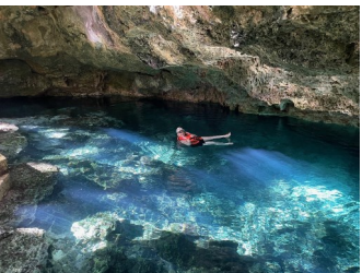
Floating In A Cenote