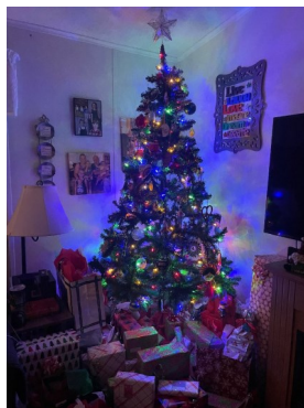
The National Christmas Tree In Government House.