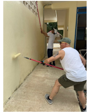
Painting A School