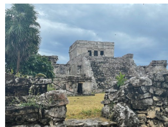
El Castillo of Tulum