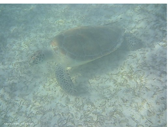
Magnificent Sea Turtle