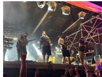
Chorus In The Rain