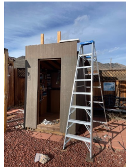
Changes afoot! Molossia's Post Office is being moved and converted to become the new Customs Office—new Post Office to come!