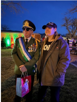
The President and a Fan